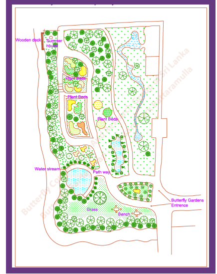
The proposed butterfly garden design

This project will ensure the conservation of butterflies while providing opportunities for knowledge creation, research and education.